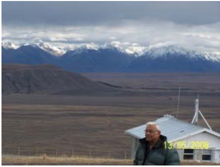
View from Mt. John's Observatory

Lake Tekapo is about 40 miles from Mt. Cook. There is a cute little church called The Good Shepherd, built in 1935. The church is right at the edge of the Lake. Opposite the church was the statue of a dog in Bronze. I forget the story, but it had something to do with the faithfulness of the dog.