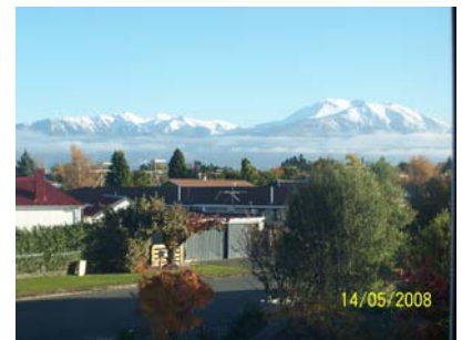
from our window at skibos

It is essentially a ski resort and offers other out door sports too. The description seemed totally justified in what the place looked like. Seemed a very desirable place to stay in, with its chalets looking over the Gorge. But guess what? It was closed!! We were surely taken aback that a resort of that size was closed. So after the enjoying the scenic beauty of the place we drove up to Methven, the township of Mt. Hutt Lodge. On looking around we decided to take a B&B called Skibos, on Forest Road, run by a very pleasant Liz. Our room had a stunning view of the snow