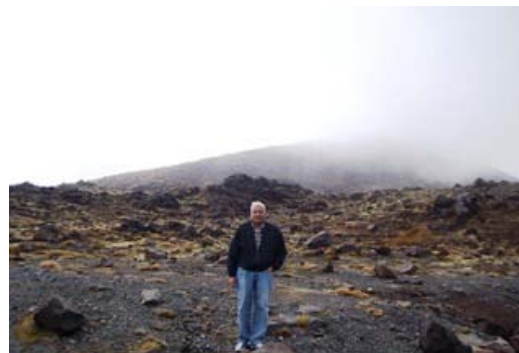
Lava land Whakapapa 1

We took a 'tour' of the hotel and checked out all the facilities—gym, laundry room, library, home theater, et al. by now the lounge was fairly well occupied. There were two fire places and both were occupied. The majority was senior citizens like us and more. Some couples who must have traveling alone were sitting by themselves with their drinks. We spent a rested evening with dinner in the hotel