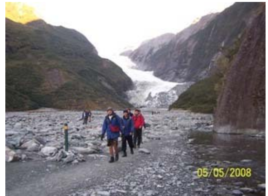
Franz Josef Glacier

We arrived at Greymouth by 12.45 pm. This time we took a GPS with the car, since it was $10 per day as against $25-30 quoted on the earlier laps. This was a first for all of us, so we were quite excited. The GPS led the way once we punched in the address and checked us with shouting ‘recalculating, recalculating’ as soon as we took a wrong turn. Sometimes she went on and on till we felt like saying (and said it too), ‘shut up’! We reached Franz Josef in about 2 ½ hours. As soon as we checked into the Alpine Glacier Motel, we decided to go to the glacier as otherwise it would get dark and we would not be able to do it the next day. The walk from the car park to the edge of the glacier was about 1 km. There was a large Gujerati group from Atlanta, as vociferous as ever.