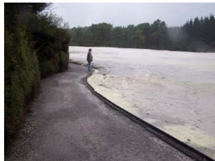
Wai O Tapu Thermal Park

The walk through this unique volcanic area took us about an hour and a half. And all this in a light rain, without a rain coat or umbrella! The whole area consisted of multi colored pools of hot water, steaming ground and expansive vistas. There were unique terrace formations and some constantly bubbling and erupting mud pools. All this in its natural setting. In some places these terrace like formations looked like glaciers, because the surface was whitish in color and the expanse was sloping down one side. All this was surely a