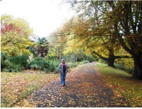
Botanical Garden, Christchurch that the weather prediction was 'cloudy but no lain'.