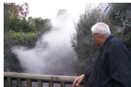
Kuarau Sulphur Spring, Rotorua

So it was a while before we were on our way to Rotorua in a Subaru by Europcar. It was a smaller car which was why the baggage was packed in with some difficulty. On way to Rotorua, we stopped at Fitzgerald Grove—called so because of the grove formed by the fern trees. The café at the end of it, where we had planned to have coffee was closed unfortunately. So all we could do was to admire a huge Emu, a cow and a white billy goat. They were either lazing or 'chewing the cud'.