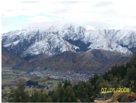
View from Crown Range Summit

Our next stop was to be Te Anau, to be near the Milford and Doubtful Sounds. People had said not much would be available there so we shopped for wine and some grocery before leaving, not to forget the make- shift raincoats made of thin plastic. The latter being very important for the Sounds.