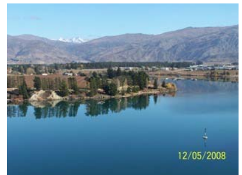
Driving towards Twizel

Our drive was through a landscape which had an interesting blend of brown mountains interspersed with blue river and the