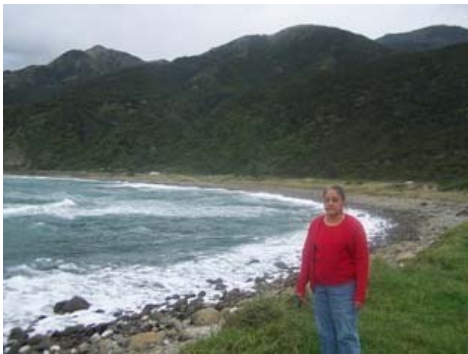
En route to Kaikoura

Destination Kaikoura! We left at 10. I drove all the way. Being wine area, we passed long stretches of vineyards. It was interesting to see how they were tagged with the names of different grapes, I suppose. The major part of the drive was pretty close along the sea. One view point was the peninsula seal colony. These seals were better looking than the San Francisco seals (which were ugly and called sea lions). These were smaller and black. Across the road was a walking track which led to a water fall. En route we could see some baby seals frolicking in the little rivulet. It was a pretty cold and windy morning.