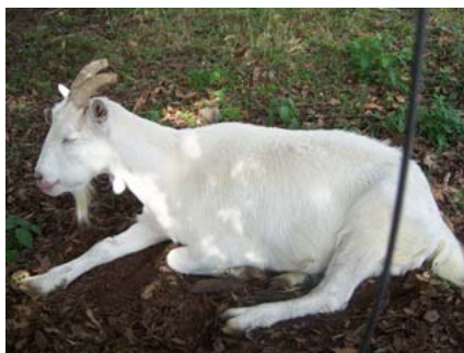
The Lazy Billy Goat

The day arrived when we had to leave Hamilton. This day started with a bit of learning about traveler's cheques! We discovered that they are almost obsolete. We had been warned about this, but being old timers, we did not feel secure with only a credit card and cash. It took a long time to get them cashed. The reason being that with all of us wanting to exchange ours at the same time, the girl at the bank (only a few months into her job) was quite perplexed and had probably never handled that amount of cash! Bankers are seriously considering not taking on this anymore. Each transaction takes a minimum of 15 minutes. Turned out to be quite and educative morning.