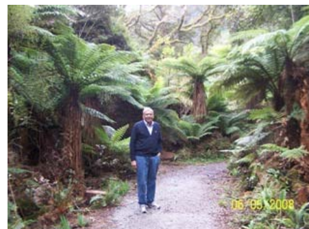
Toward's Roaring Billy Falls

The drive continued along lakes and dense fern populated hills and we reached Arnott Point which had a three sided view of the ocean, with the horizon not visible. It stated on the info plate that there was nothing between there and the Antarctic on the west side. We stopped next at the Roaring Billy Falls. Roaring Billy Falls is one of the several waterfalls tumbling down the Haast River Valley walls before feeding the powdery blue Haast River. Along the river at the base of the falls was a wide stretch of pebbly area and the fun was walking towards this area from the road. One has to walk through a dense rain forest