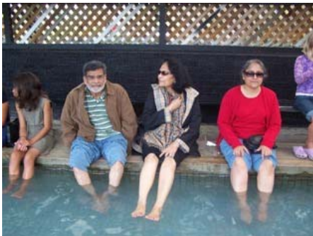
Ah! What comfort!

Rotorua is renowned as the heartland of Maori culture. There are 16 lakes in the vicinity of Rotorua, many of which are fishable lakes packed with rainbow and brown trout. The lakes, all formed from the craters of extinct volcanoes, are a popular attraction for many water-based activities. From the moment visitors enter Rotorua they know they're somewhere quite different. Whether it's the sneaky threads of steam finding unlikely escape routes in parks, pathways and streets or the distinct scent of sulphur wafting through geothermal hot spots, Rotorua offers an impressive welcome.