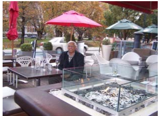
Awaiting the Tempura fishy

Back at Cathedral Square we meandered around the river path before taking the tram to the City Mall. On one side of the Mall there was a line of restaurants which were facing the river. We sat in one which had little 'angeethi' like contraptions. Glass encased squares with 'coals' in the center fired by gas. It was cold outside and this was under an awning. We were amazed at how warm the place was with this, till we looked up and saw that there were blow heaters along the edge of the awnings! Brilliant idea! Especially since we wanted to sit out doors and not inside. So we had some wine and a plate of Tempura fish. After that we browsed around the shopping area and bought some gloves and socks for my self as it was getting rather cold and the glaciers were yet to come.